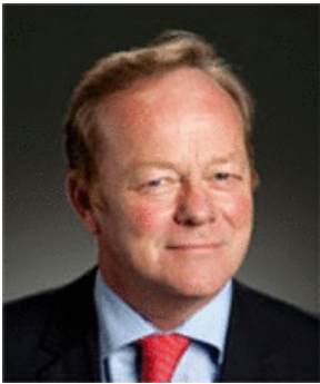
Ditlef de Vibe